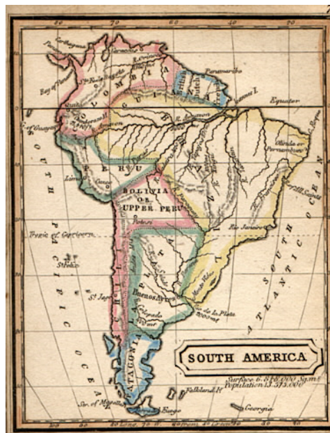
Hardy's Miniature atlas, and comprehensive geography, containing thirty maps, with letter-press descriptions. Dublin, Hardy & Walker; London, Ball, Arnold, and Co., 1840.