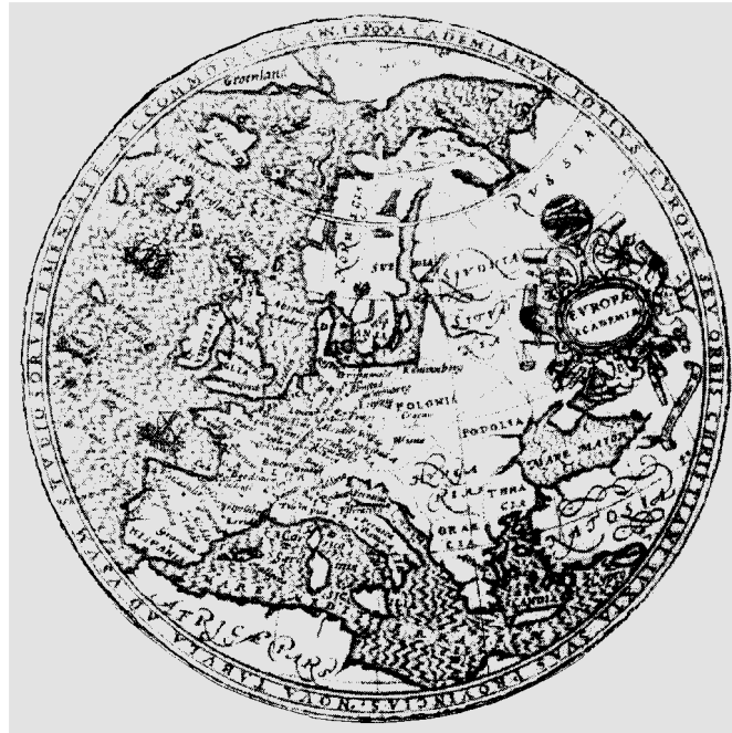
Map Collector Publications

While he was resident in London between 1583 and 1592, Jodocus Hondius engraved a set of five beautiful roundels with lettering within their borders and a diameter of only about 85/90 mm: