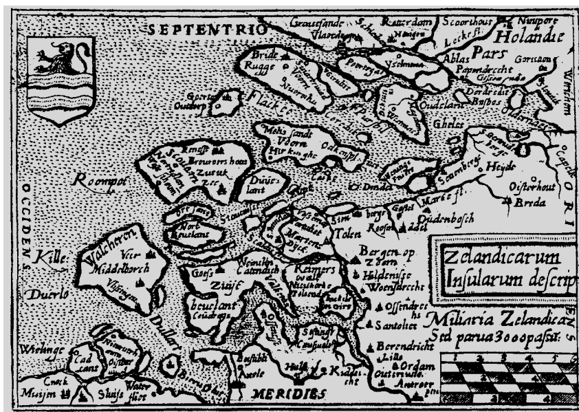
J.A.L. Franks & Co.

Anfiteatro di Europa. Venice, Giacomo Sarzina, 1623.