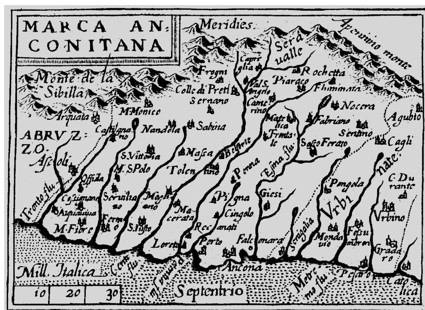
J.A.L. Franks &amp; Co.

The engraver of the miniature plates is not known, but they were copied from those by Philip Galle in his pocket Ortelius and not those of Pietro M. Marchetti in the Italian version. The source must have been an edition of 1595 or later, possibly the 1602 one with Italian text. It is thought that they were not reprinted.