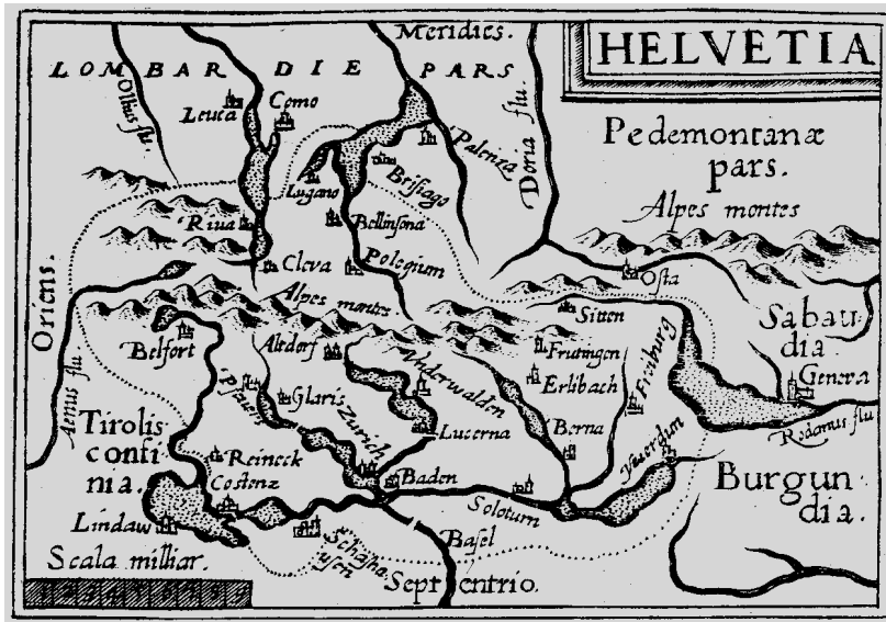
J. A. L. Franks &amp; Co.

A book about Europe written by Giovanni N. Doglioni was issued in 1623. Its Venetian publisher, Giacomo Sarzina, illustrated it with maps set within the text, each about 105/110 x 70/80 mm.