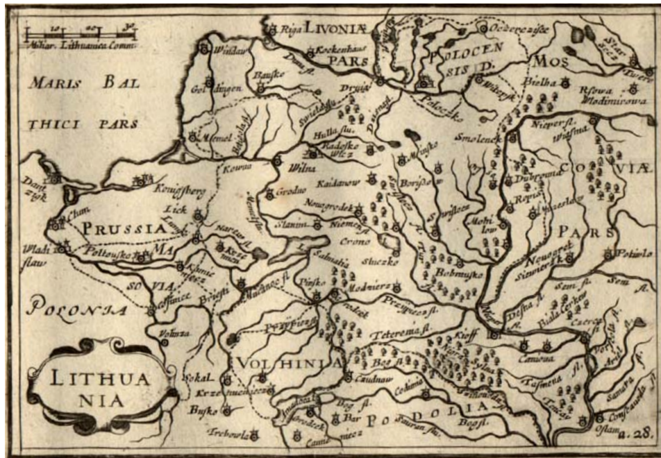
J.A.L. Franks &amp; Co.