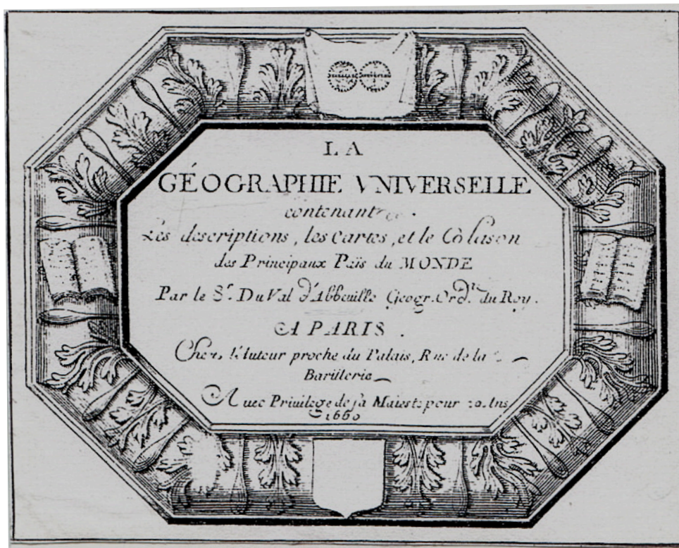
American Geographical Society

The first edition of Du Val's geography lacked a few maps: Iceland, the two polar ones and two relating to Swedish acquisitions by various treaties (see 1663). A copy in the New York Public Library seemingly lacks a title-page and was catalogued according to the world map's wording (see below), it presumably being taken for an illustrated title-page.