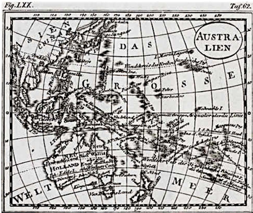
J.A.L. Franks & Co.

Die Oestliche halbkugel; Die Westliche halbkugel; Nordliche halbkugel der Erde; Südliche halbkugel der Erde; Obere halbkugel der Erde auf den horizont von Leipzig; Untere halbkugel der Erde auf den horizont von Leipzig; Europa; Asien; Afrika; Amerika; Nord Amerika; Süd Amerika; Australien.